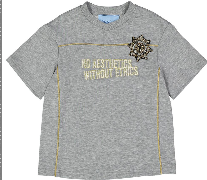
Grey melange girls' collection